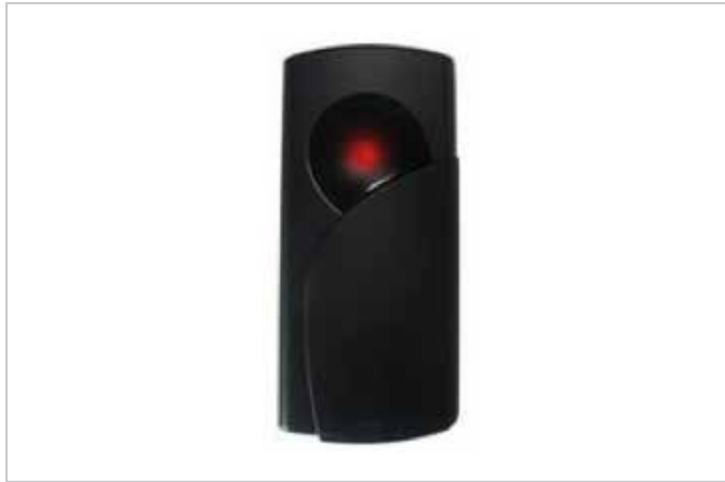
product name: SR10M (ID/Id card) wiegand