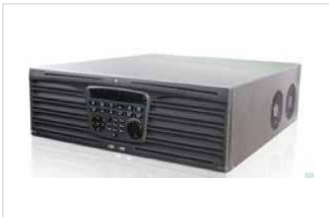
product name: DS-9116HFI-XT Standalone DVR