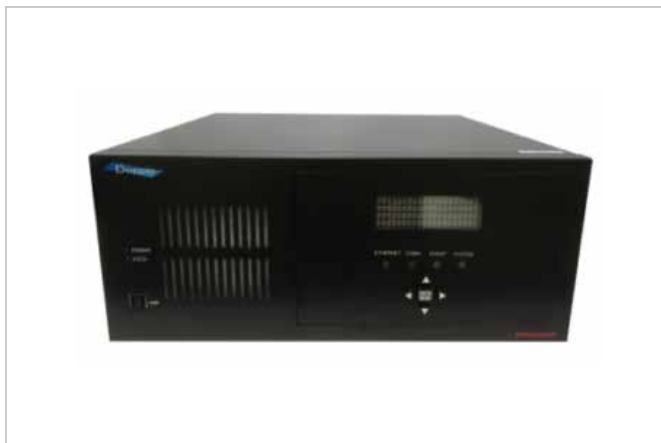
product name: Doppio / Doppio mini Hybrid Receiver