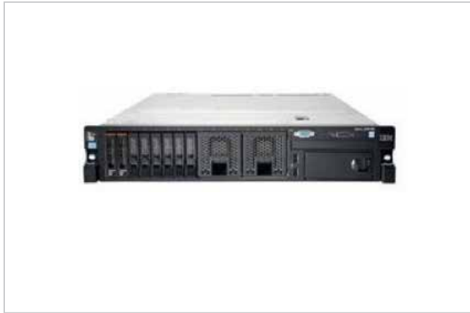
product name: IBM System x3650 M4