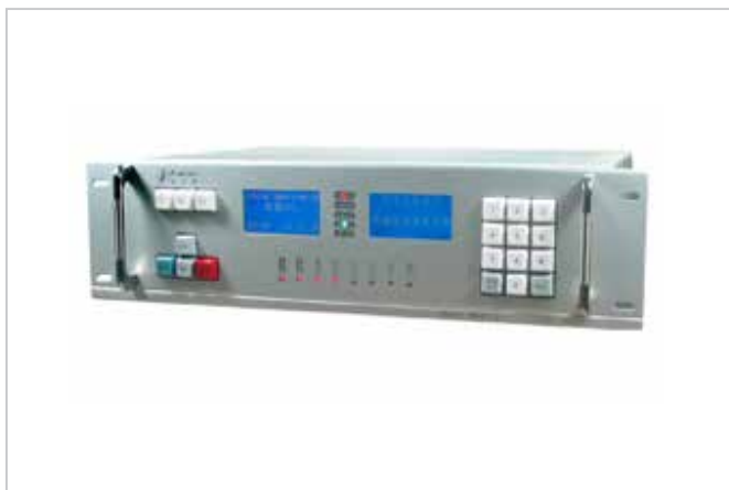
product name: FC-110-22