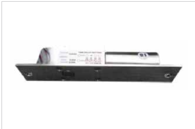
product name: AL-300 Electronic lock