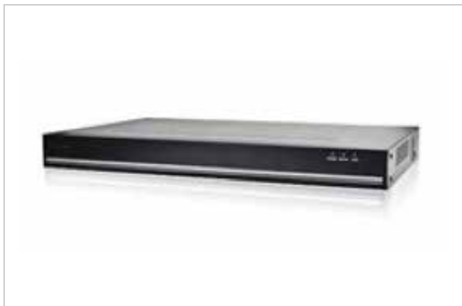
product name: DS-6716HW DVS