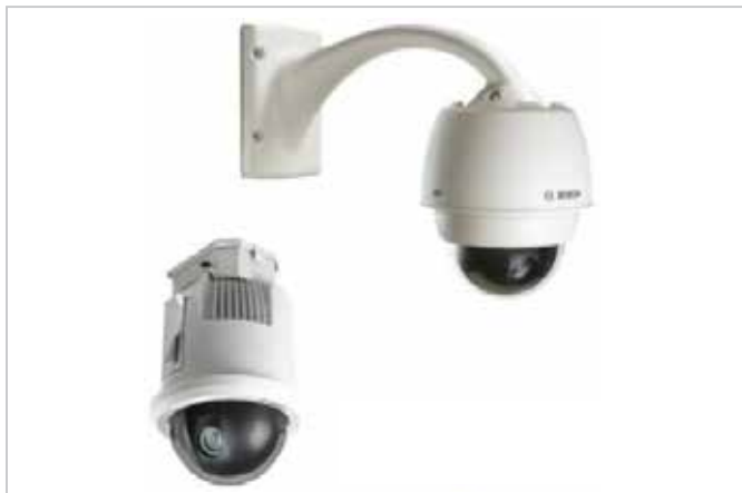
product name: AUTODOME IP dynamic 7000 HD