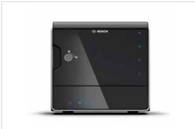
product name: DIVAR IP 3000