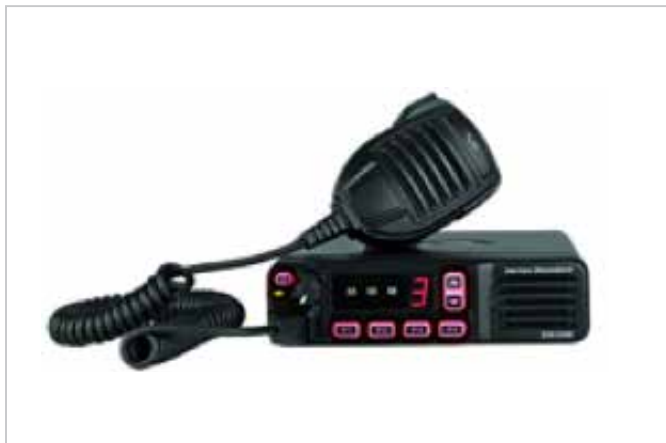
product name: EVX-5300 Series