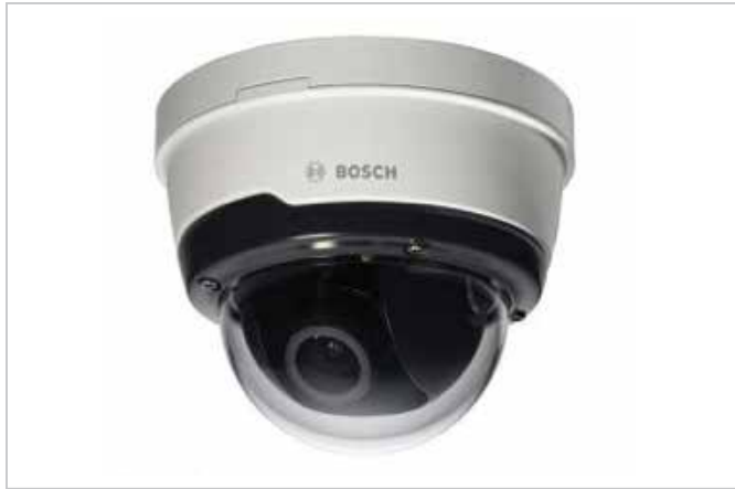
product name: FLEXIDOME IP outdoor 5000