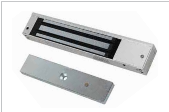
product name: AL-350 (LED) Electronic lock