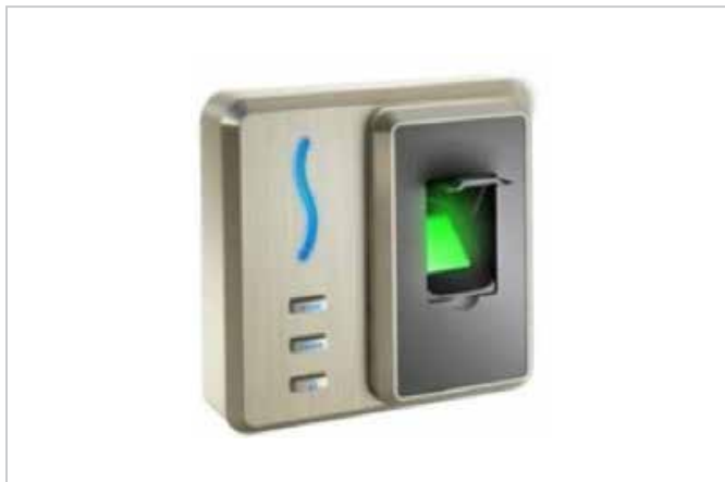
product name: SF101 Fingerprint Access Control