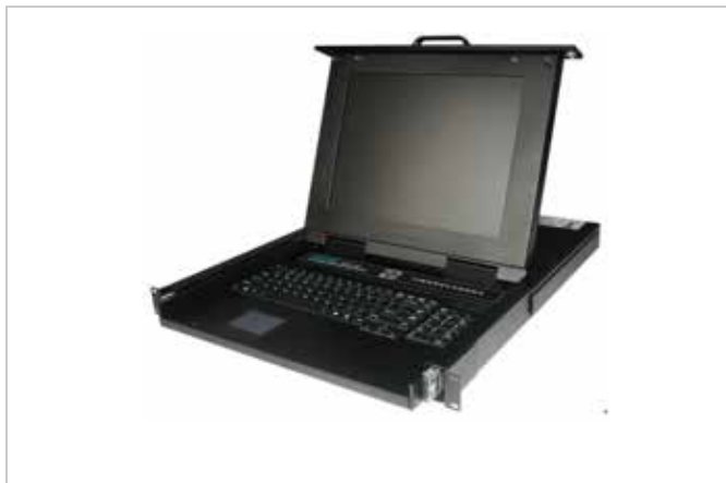
product name: DKVM-L916H