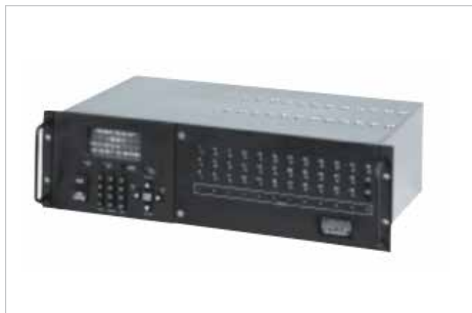
product name: MX8000