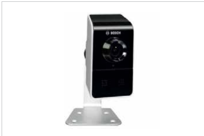
product name: IP micro 2000