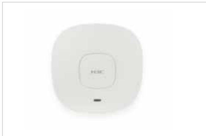
product name: 450Mbps indoor AP H3C WA3600 I series