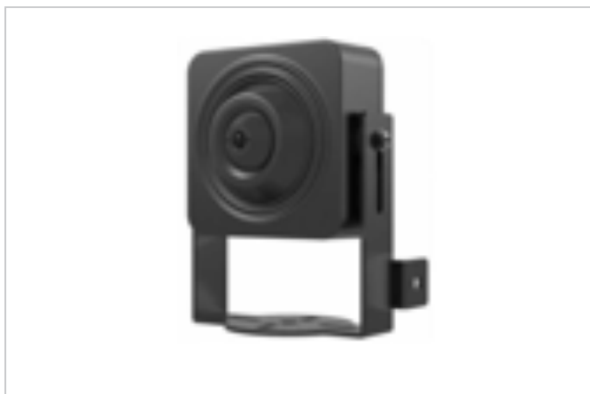
product name: DS-2CD2D14WD 1MP 1/4" CMOS pinhole camera