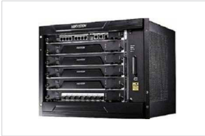
product name: DS-B10 series