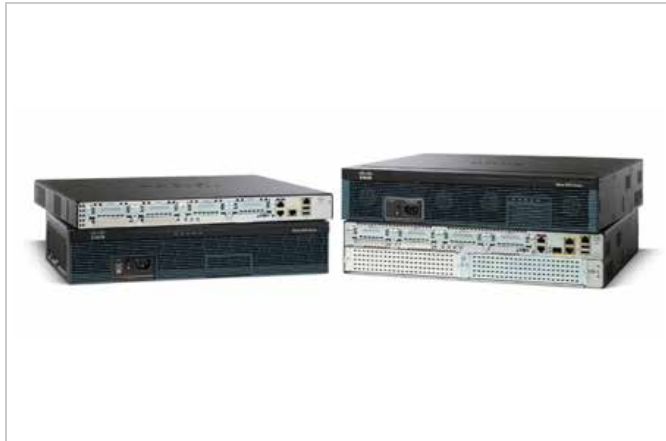
product name: Cisco 2900 Series Integrated Services Routers