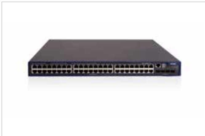
product name: Switch H3C S3600-SI series