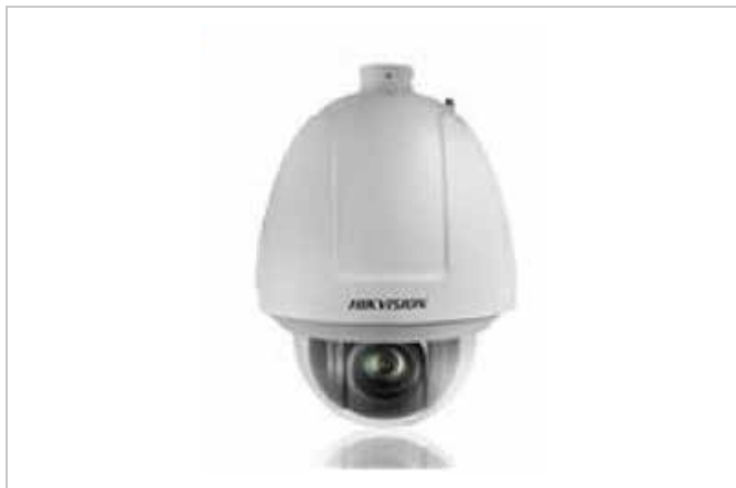
product name: Automatic tracking ball camera