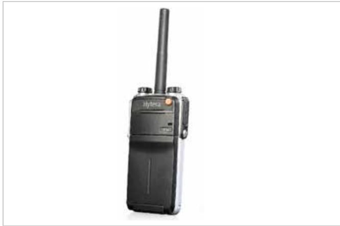
product name: X1e