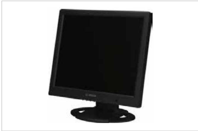
product name: UML-19P-90 19-inch Color LCD Display Monitor (VGA)