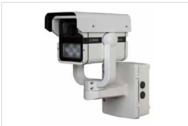
product name: DINION IP imager 9000 HD